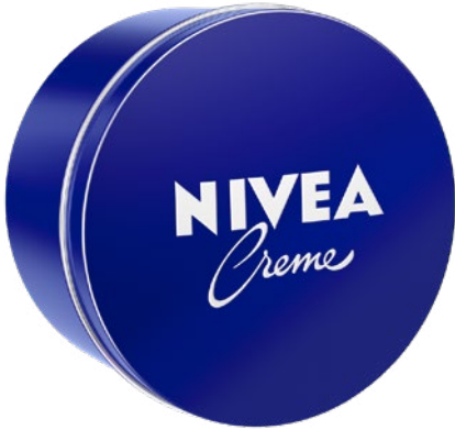
Beiersdorf changed the way the Nivea cream tins are produced and reduced the number of materials used for the tins