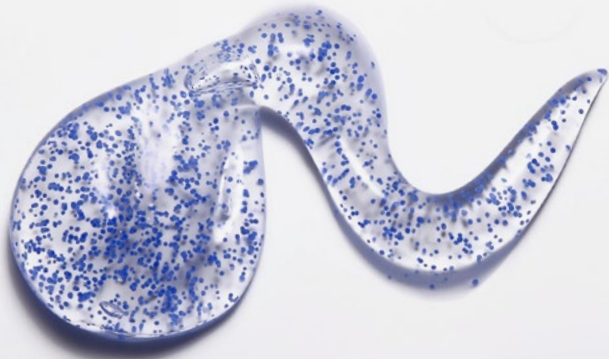
Beiersdorf has used no peeling particles made of polyethylene in any of its care products worldwide since the end of 2015

to let go of some of what made us successful in the past and replace it with technologies that we do not fully master yet. How to combine our internal strength with all the external knowledge that is accumulating at an unbelievable pace. How to evolve the culture that is excited about new possibilities to fully embrace the inevitable change.