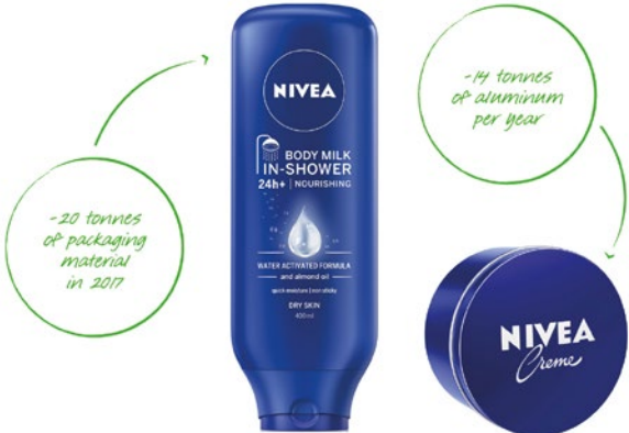
Saving packaging material is key