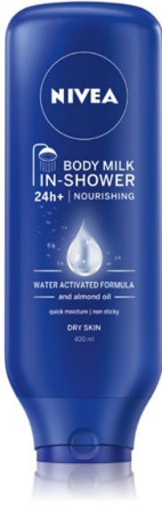
For the optimised packaging for Nivea In-Shower the wall thickness was reduced